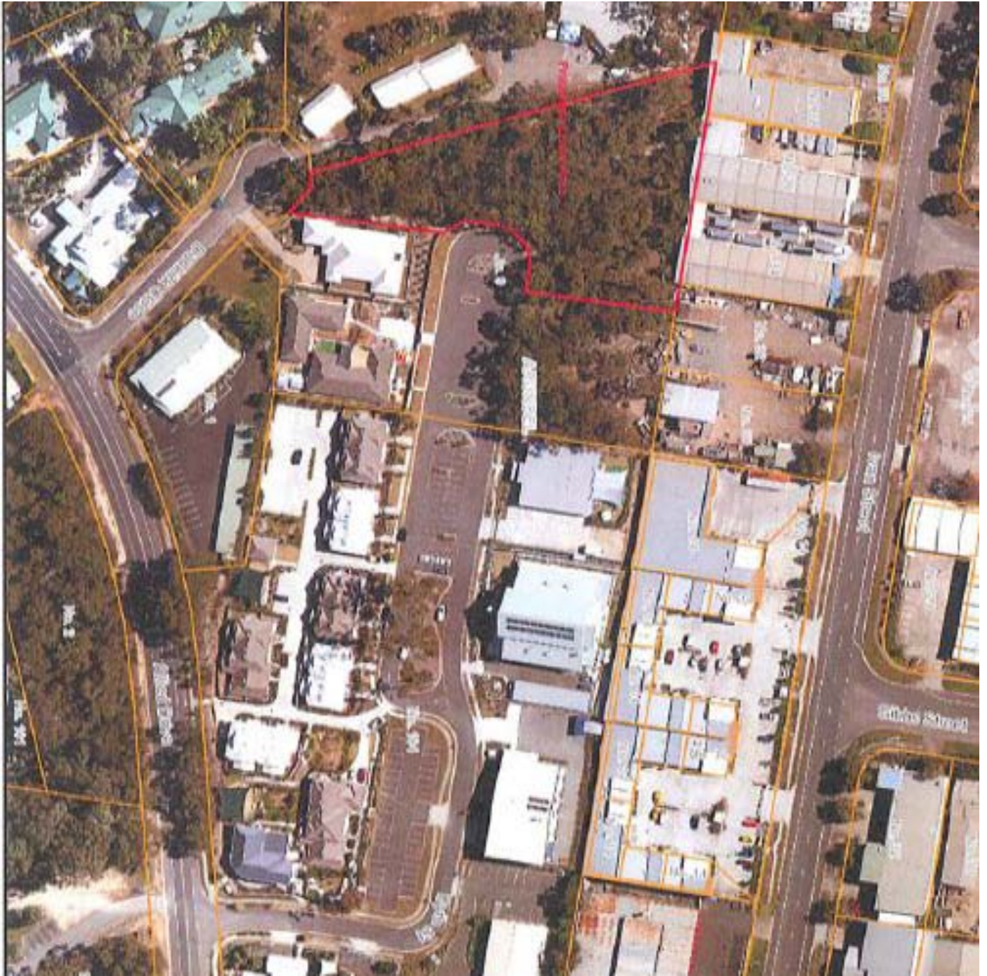
Gold Coast City Council Land – Area in Red Allocated to GCHCA