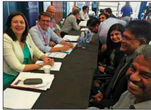
• Meeting the Premier.

Being a second generation Indian, we have limited opportunities to connect with our