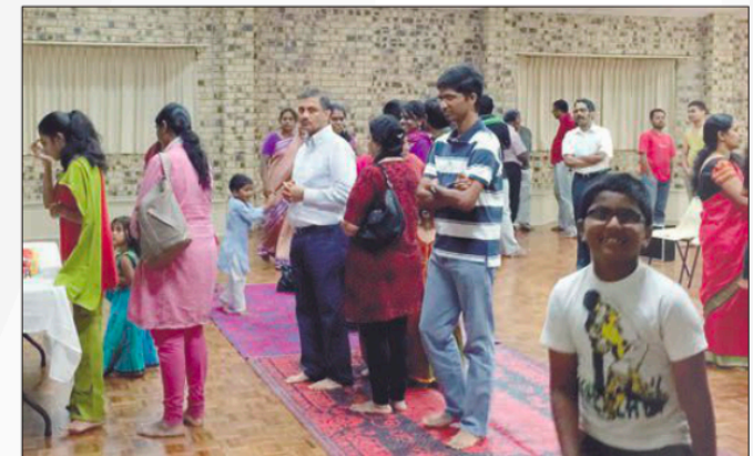
• GCHCA Bhajan night.

GCHCA warmly invites one and all to our special Pongal/ Maha Sankranti centric bhajan on Friday, 17 th of January at the Helensvale Community Centre (31, Discovery Drive, Helensvale). Please gather at 7pm for a 7.15pm start.