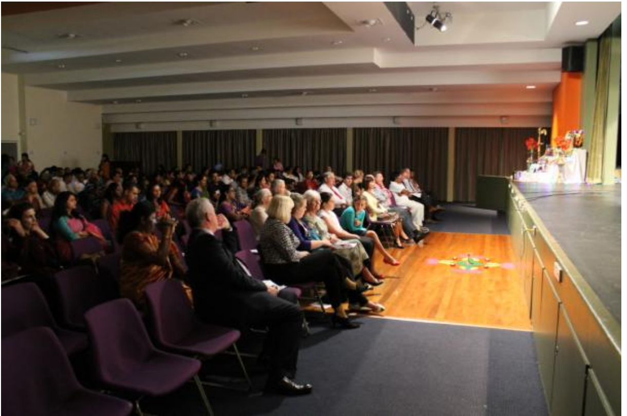
Fig 1: Navaratri Event